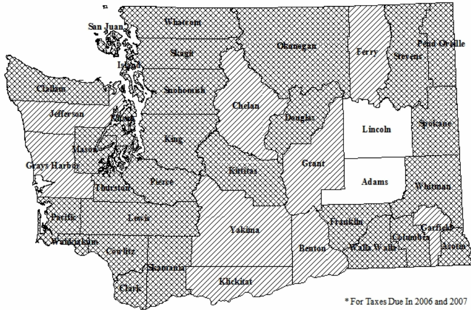
Chart 1 Growth In Assessed Valuation 2005 - 2006 *