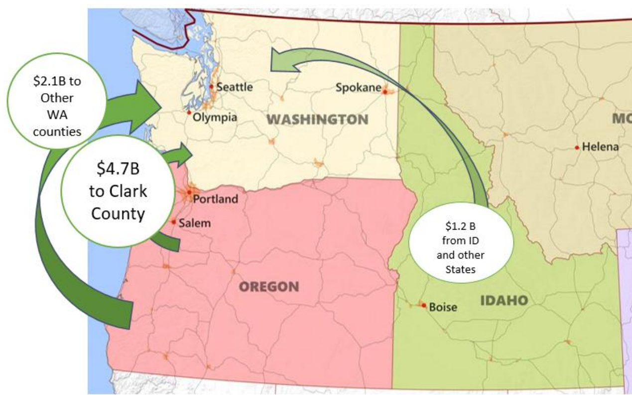
Figure 2. Estimated inflow of earnings from Oregon, Idaho and other states. Author’s analysis of data from the US Bureau of Economic Analysis and the Oregon Department of Revenue.