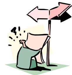
The Comparison Report is designed to serve as a starting point for the administrator or decision-maker.

Nearly 50 percent of counties are experiencing a flat or reduced budget level while many are managing continued growth in parcels and workload."