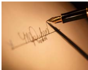
New Levy Certification and Resolution/Ordinance forms are available to taxing districts.

In response to a request from several assessors, the Department has created a standardized Resolution/Ordinance form that may be used by taxing districts that want to increase their property tax levies. The form, which has been sent electronically to all assessors, includes all the information required by RCW 84.55.120 (based on Referendum 47). The form is intended to be a tool that assessors and taxing district officials may opt to use to ensure the requirements of the statute are met. However, it is not mandatory that taxing districts use this form. Some districts already have a format they use in developing resolutions or ordinances. That's okay. Some districts may want to take some language from our new form and include it in their own format. That's okay, too. The important thing is to ensure taxing district officials know what information must be included in a resolution or ordinance in order to receive the property tax dollars they need.