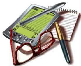
Our goal is to review levy calculations in all counties within the next two years.

Initially, we attempted to verify the highest lawful levy for each taxing district since the 1985 assessment year. This meant recalculating the levy limit for each year since 1985. However, sometimes the data wasn't available to calculate all levies back that far. Sometimes errors were found in the early years, and those errors compounded over time to become a much larger error in the current year. There is no clear statutory mandate to correct errors that occurred prior to January 1, 2002 -- even if those errors result in an error in the current year. Therefore, we have decided to take a prospective approach to levy reviews and begin our reviews with levy calculations for the year in which we first visit a county.